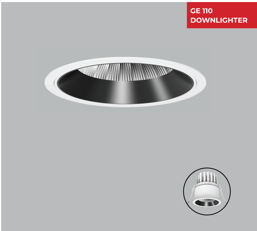
GE 110 DOWNLIGHTER

GE 110 Recessed COB Spot light Downlighter is Fixed led Downlight made up of die cast aluminium housing, Finned heat sink to dissipate heat, increase performance and with premium powder coated finish.